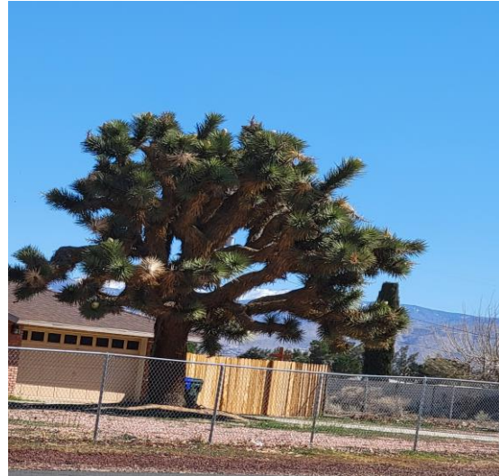
Pictured above is a large Joshua Tree in a neighbor's front yard. Joshua Trees are protected, so houses are built “around” them.

The Mojave Desert is best known for the Joshua Trees that grow here. They were named by the Mormon settlers on their way to Utah. One story has it that the branches were Joshua's arms outstretched in prayer, another was the trees' shapes and sharp “leaves” brought to mind Joshua's army conquering the promised land, or perhaps guiding the way to Utah. The Joshua Tree is not really a tree but part of the Agave group of plants. They grow very slowly and often live to be 150 years old or more.