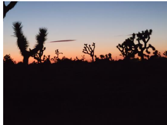
A beautiful sunset silhouetting Joshua Trees.