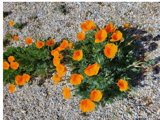
A lot of wild flowers grow in the high desert. The most well-known is the California Poppy, also the state flower.