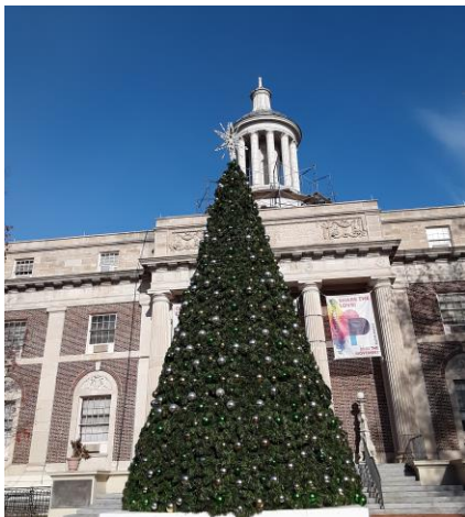
Plainfield City Hall, with the town Christmas Tree.