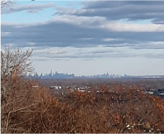
View eastward from Washington Rock, with the New York skyline in the distance.

There are picnic tables and trails to hike on, and you can often find families taking walks with their dogs on the trails. On a clear day, you can see all the way to the New York skyline from Washington Rock.