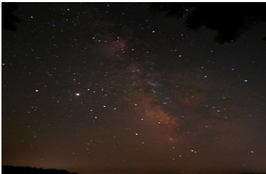
The night sky over Pilgrim Lake

from Divinity Course and General Collectanea , (the “Blue Book”), by Mary Baker Eddy, page 225