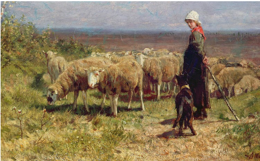
The Shepherdess by Anton Mauve

6 Surely goodness and mercy shall follow me all the days of my life: and I will dwell in the house of the Lord for ever.