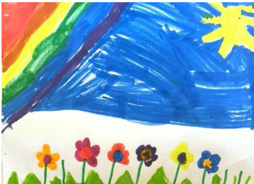
Drawing by Abby