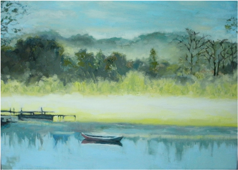
Painting by Dale A.

Every pure thought falling silently and gently into human consciousness does its part in cleansing the whole world, just as every falling snowflake does its silent share in transforming the noisomeness of the grimy earth into a soft white blanket of purity. We must remember that the smallest truth is mightier than the greatest lie the world has ever known.