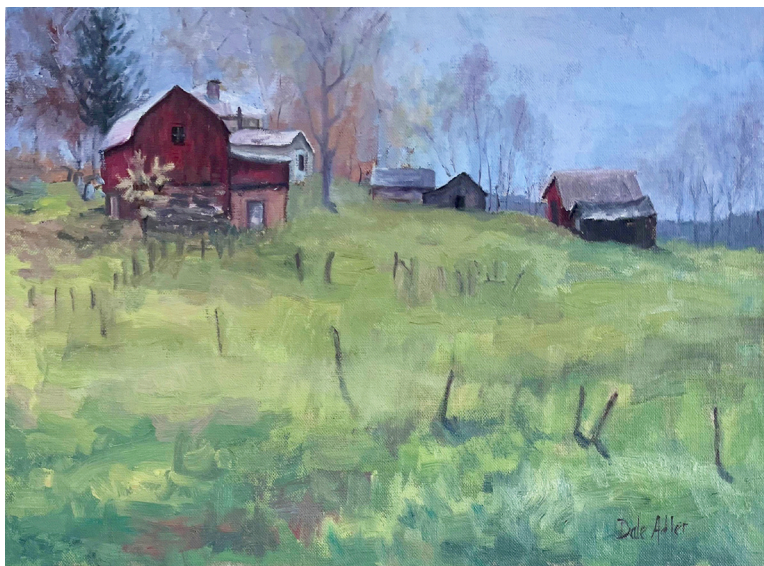
Painting by Dale A.

When the poor and needy seek water, and there is none, and their tongue faileth for thirst, I the Lord will hear them, I the God of Israel will not forsake them. I will open rivers in high places, and fountains in the midst of the valleys: I will make the wilderness a pool of water, and the dry land springs of water.