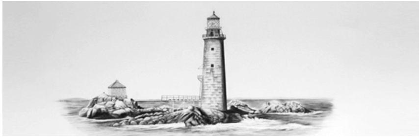
Drawing by Luanne Tucker