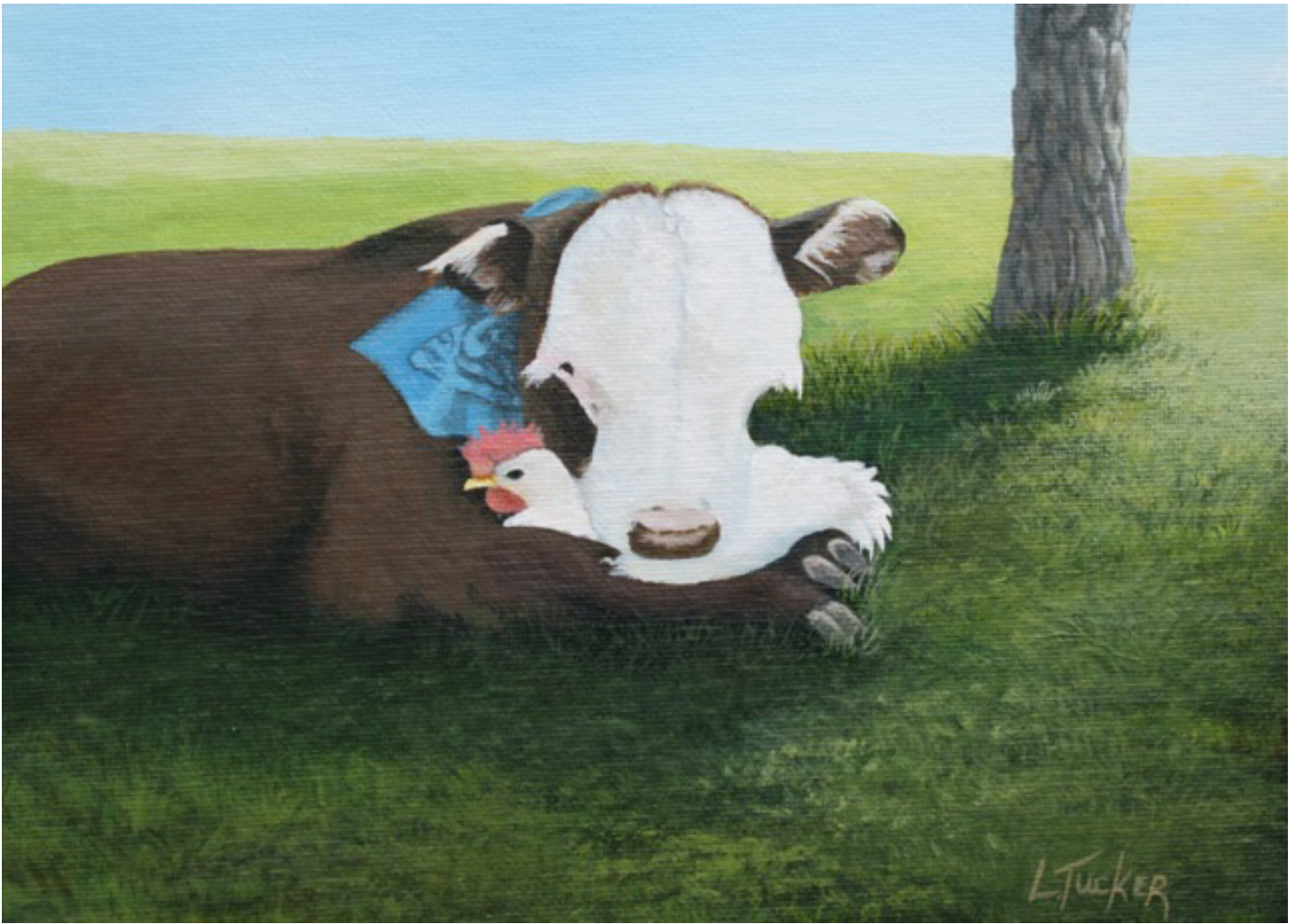
Trusting in Love