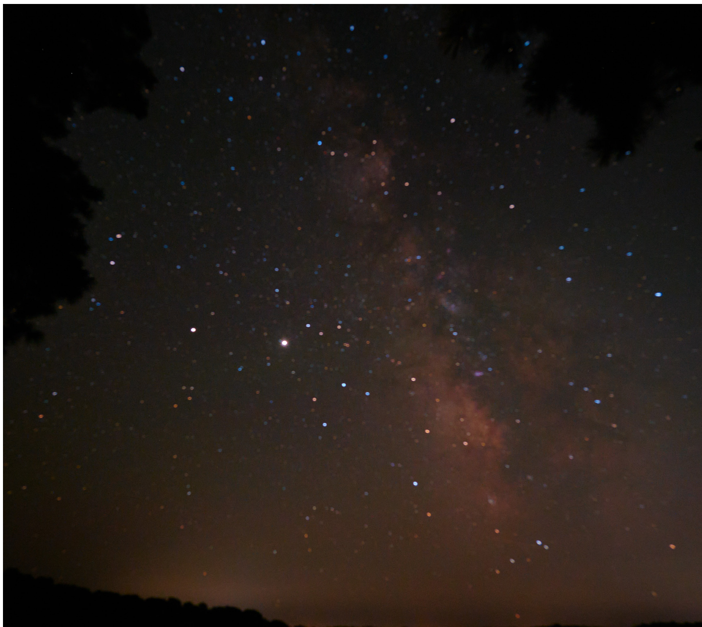
The night sky over Pilgrim Lake