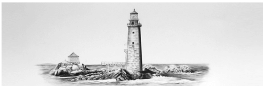
Drawing by Luanne Tucker

331 Claremont Road Bernardsville, New Jersey 07924