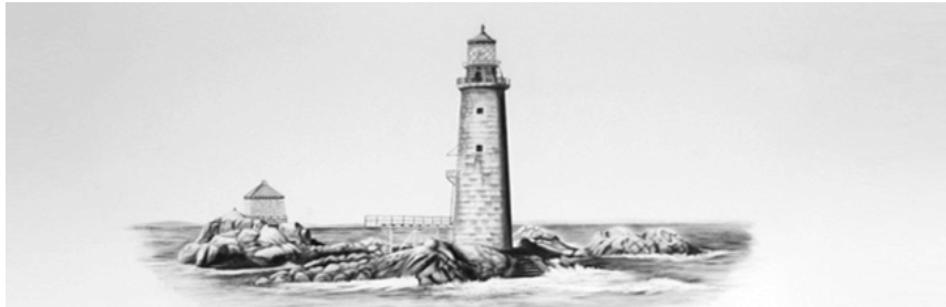
Drawing by Luanne Tucker

331 Claremont Road Bernardsville, New Jersey 07924