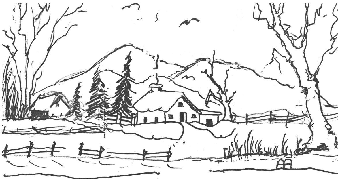
Drawing by Art Anker