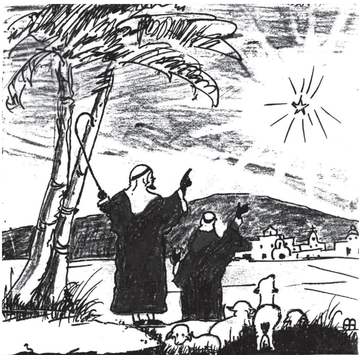
Sketch by Art Anker