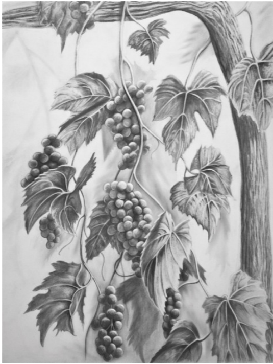
Drawing by Luanne Tucker