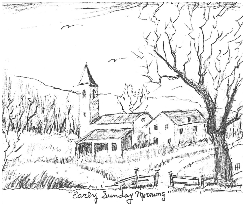
Sketch by Art Anker