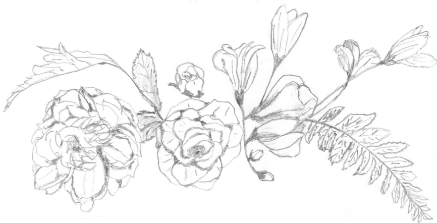
Drawing by Lil Linnell